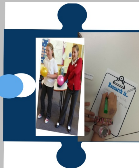
Dulliau Ymchwil Research Methods