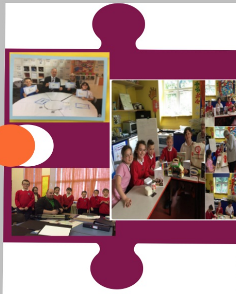
Cyfarfodydd Cyd Gynhyrchu Coproduction Meetings

Enable children to consult with their peers