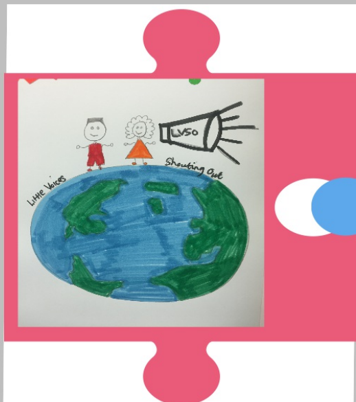
Hawliau Plant Children's Rights

Mae Lleisiau Bach yn cefnogi plant a phobl ifanc i wneud ymchwil o fewn Confensiwn y Cenhedloed Unedig ar Hawliau'r Plentyn