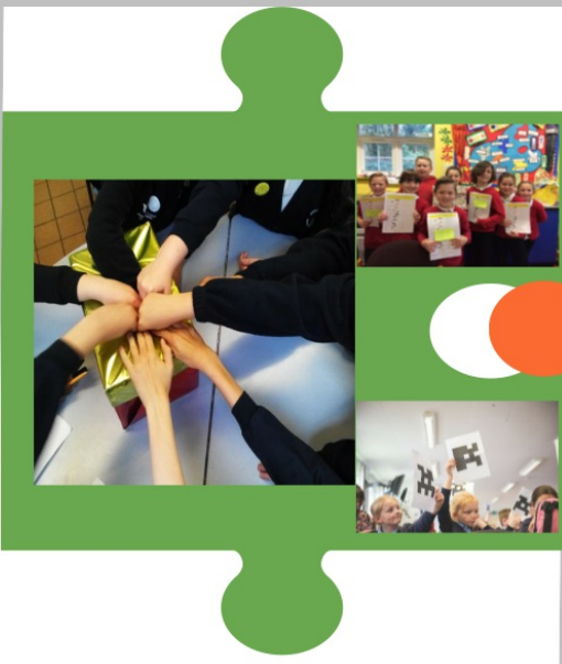
Diwrnod Ymchwil Research Day